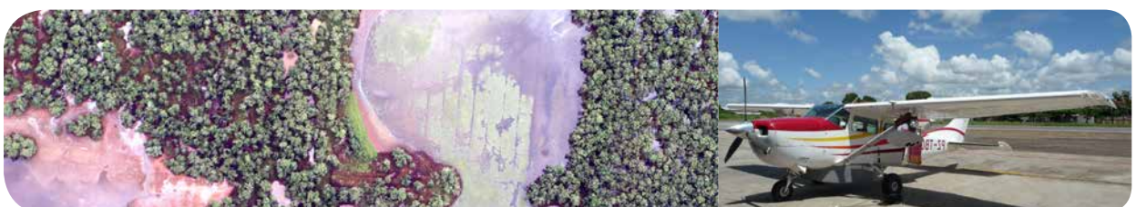
Rainforest inventory in Suriname